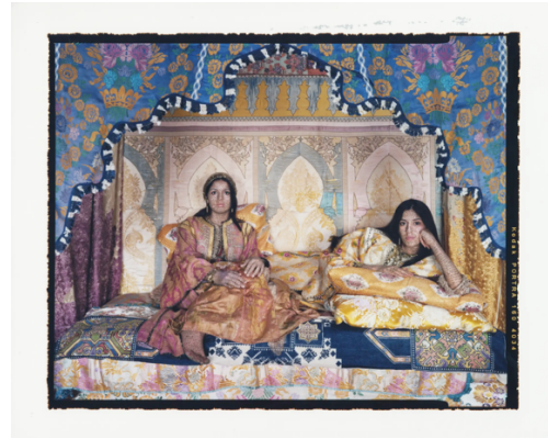
L: Lalla Essaydi's work in She Who Tells A Story , National Museum of Women in the Arts R: Lalla Essaydi, Harem Revisited #51 , 2013