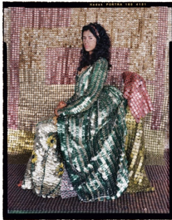
Lalla Essaydi, Conflicted Identities #5, 2023